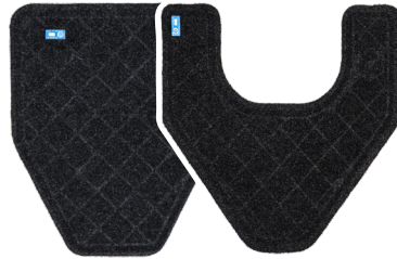
Disposable anti-microbial restroom mats