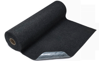
Disposable anti-microbial matting by the roll