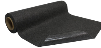
Disposable anti-microbial matting by the roll