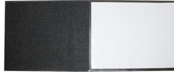
WaterHog mat followed by an adhesive surface